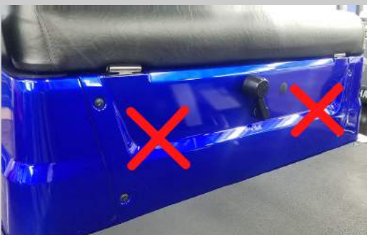
Poor "Open Air" Environment for Speakers

For a more in-depth description on this topic, and to see how we install speakers, check out our video "How To and Not To Install Speakers in a Golf Cart" on YouTube or Facebook